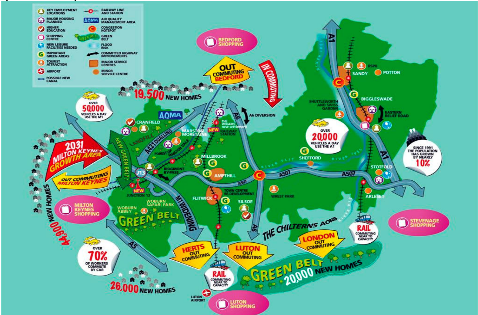
Figure 1: Spatial Issues Map